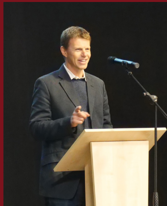
Explore, Dream, Discover! Page 4