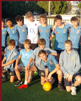
Sports Tour to Valencia Page 7