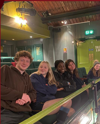
All The World's A Stage Page 3