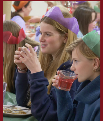
Christmas Cheer Page 8